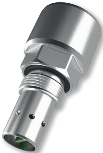
LubCos H 2 O