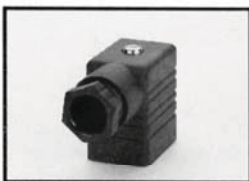
*8941004702 Old Part No. H -894100-04702