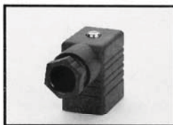
*8941004702 Old Part No. H -894100-04702