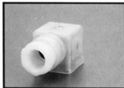
Part No. Old Part No. **R432013726 P -067261-00000 120 VAC **R432013728 P -067262-00000 240 VAC **R432013729 P -067264-00000 12 VDC **R432013730 P -067265-00000 24 VDC **R432015629 P -069417-00000 24 VAC