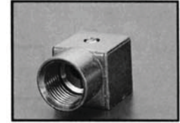
Part No. R432015781** (Old Part No. P -069707-00000) (Metallic)