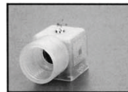
Part No. Old Part No. R432008421 P -026078-00001 120VAC*** R432008422 P -026078-00002 240 VAC*** R432008423 P -026078-00004 12 VDC*** R432008424 P -026078-00005 24 VDC*** R432008425 P -026078-00006 24 VAC***