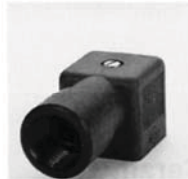
Part No. R432015404*** (Old Part No. P -068674-00000)