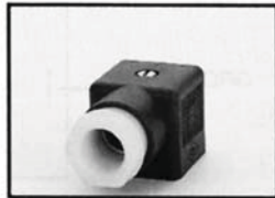
**Part No. R432013747 (Old Part No. P -067325-00000) (for use with wireways)