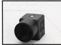
Part No. R432015626 (Old Part No P -069390-00000) (Molded Engineering Plastic)