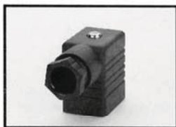
*8941004702 Old Part No. H -894100-04702