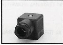
8941000302* (Old Part No. H -894100-00302) (Standard)