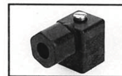
Part No. 8941012202 (Old part no. H -894101-02202)

Recommended Wire Size for Solenoid Connector: 18-22 gauge wire Cable diameter: .080" to .265" O.D. R432008830 (Old Part No. P -027609-00000) 1/2" conduit connector for 840 wireway.