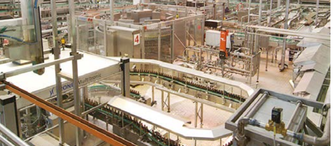
EXAMPLE: Maintain optimal lubrication by replenishing only the lubricant that is used, with small amounts at frequent intervals

EXAMPLE: Infrequent filling of the bearing results in periods of over- and under-lubrication