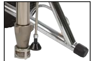
Crush-proof intake screen holds up to jobsite abuse