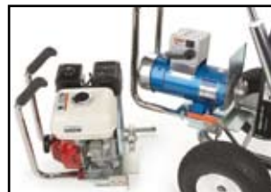
Change from gas to electric in seconds without any tools.