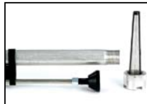
Exclusive crush-proof rock catcher provides unmatched pump protection. (patent pending)