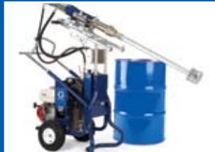
Direct Immersion Kit allows ultimate flexibility with tough-to-spray materials.