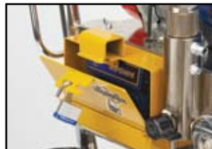
Control lock protects and locks controls

Includes: Silver Plus™ Gun, 1/4 in x 50 ft (6.4 mm x 15 m) & 3/8 in x 50 ft (9.5mm x 15 m) BlueMax II Hose, RAC X 527, RAC X 1231 Tip and Guard.