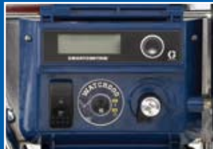
SmartControl provides high quality spray pattern plus the WatchDog Pump Protection System.