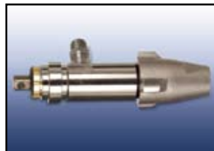
Exclusive Endurance Advantage Program eliminates downtime.

NOTE: Electric Motor Max Tip is .031 and Max GPM (LPM) is 1.1 (4.2) All units include: New Contractor Gun, 1/4 in x 50 ft (6.4 mm x 15 m) BlueMax II Hose, RAC X 517 Tip and Guard, Whip Hose. *Premium units include: AutoClean2, Digital Display and Toolbox.