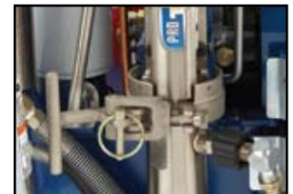
Exclusive ProConnect System, no-tools pump removal and installation in seconds.