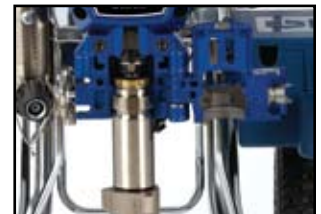
Exclusive ProConnect System – no-tools removal and installation for fast repairs on the job.