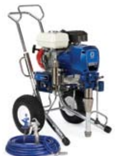
GMAX II 7900