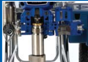
Exclusive ProConnect System – no-tools removal and installation for fast repairs on the job.

The GMAX II 7900 sprayer is the most powerful sprayer for high production paint contractors doing large tract, commercial and new residential construction jobs – where uninterrupted spraying is expected.