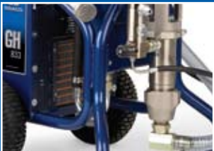
Exclusive QuikChange Pump System and QuikAccess Intake Valve eliminates down-time.

*Complete units include: Silver Plus Gun, 3/8 in x 50 ft (9.5 mm x 15 m) BlueMax II HP 4000 psi (276 bar) Hose, RAC X 655 Tip and Guard, 1/4 in x 3 ft, 4000 psi (276 bar) Whip Hose.