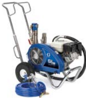
GH 200 Convertible

You can find the exclusive ProConnect System on these Graco sprayers!