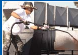
No job is too big for the GH 733 Roof Rig.

For more than 20 years contractors have turned to the GH 733 & Roof Rigs when they need to spray some of the most aggressive materials found today.