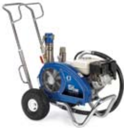
GH 200 Convertible

Max Tip: .047 Max psi/bar: 3300/227 Max gpm/lpm: 2.15/8.14 Engine: 160 cc Honda Weight lbs/kg: 160/72 Electric Max Tip: .031 Electric Max Gpm/Lpm: 1.1/4.2 Gun Support: