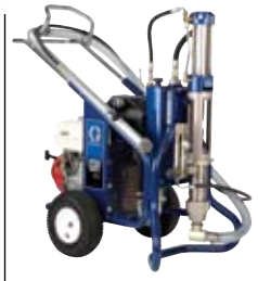
GH 833 Big Rig

Max Tip: .065 Max psi/bar: 4000/276 Max gpm/lpm: 4.0/15.1 Engine: 390 cc Honda Weight lbs/kg: 350/158 Gun Support: