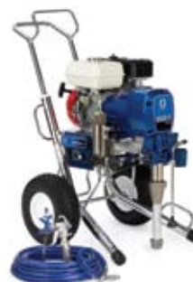
GMAX II 5900