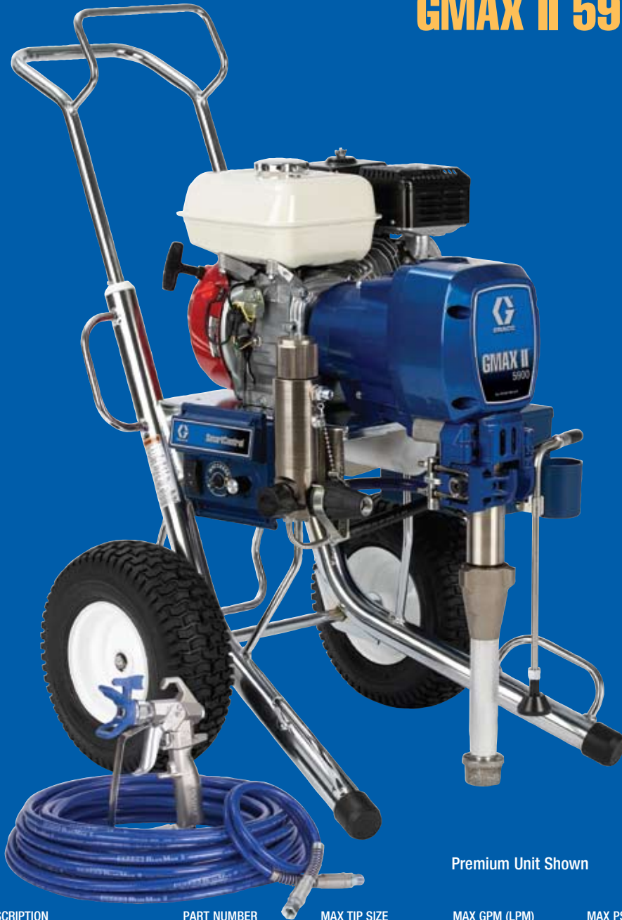
Premium Unit Shown