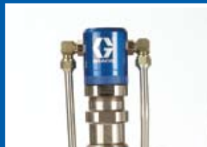
Graco hydraulic power – a proven workhorse for long-life and reliability.