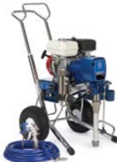
GMAX II 3900