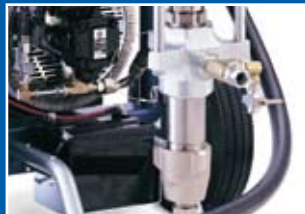
6 interchangeable pumps allows maximum versatility for all applications.