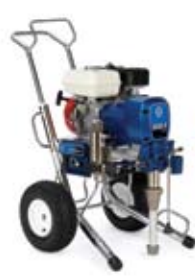
GMAX II 5900