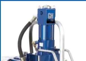
Graco Hydraulic System – a proven workhorse for long-life and reliability.

*Complete units include: Silver Plus Gun, 3/8 in x 50 ft (9.5 mm x 15 m) BlueMax II HP 4000 psi (276 bar) Hose, RAC X 517 Tip and Guard, 1/4 in x 3 ft, 4000 psi (276 bar) Whip Hose.