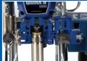
Exclusive ProConnect System – no-tools removal and installation for fast repairs on the job.

The GMAX II 5900 is the most demanded sprayer for the professional contractor spraying new residential/commercial jobs – who knows what it takes to get the job done right, the first time.