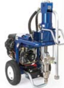
GH 733 & Roof Rigs

Max Tip: .060 Max psi/bar: 3500/240 Max gpm/lpm: 3.0/11.4 Engine: 624 cc Kohler Weight lbs/kg: 480/217 Gun: