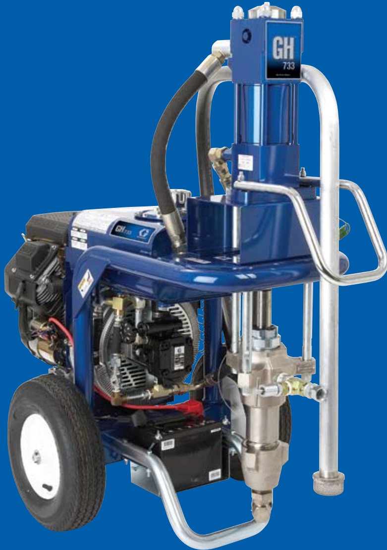
Bare Unit Shown