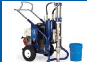
5-gallon direct immersion for the heaviest, most difficult coatings.