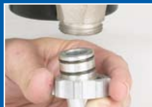
Inlet tube removes by hand for easy clean up.