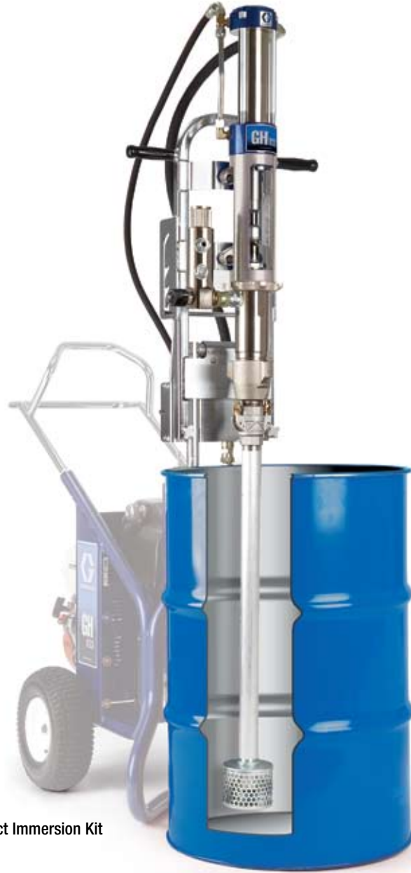
GH 833 Direct Immersion Kit Part #287843

In a matter of minutes you can convert your GH 833 into a direct immersion workhorse unit. Now you can spray it all – only with Graco.