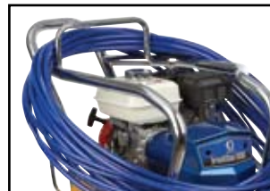
Extreme-duty roll cage frame with a build-in hose wrap