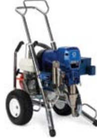
GMAX II 5900 Convertible