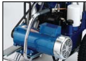
Convertability allows no-tool gas or electric power in seconds.

NOTE: Electric Motor Max Tip is .031 and Max GPM (LPM) is 1.1 (4.2) All units include: Silver Plus Airless Gun, 3/8 in x 50 ft (9.5 mm x 15 m) BlueMax II Hose, RAC X 517 Tip and Guard, Whip Hose.