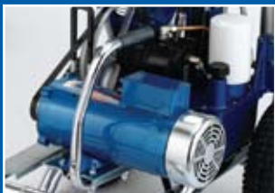
Convertability allows easy switching from gas to electric in seconds.

All units include: New Contractor Gun, 1/4 in x 50 ft (9.5 mm x 15 m) BlueMax II Hose, RAC X 517 Tip and Guard, Whip Hose.