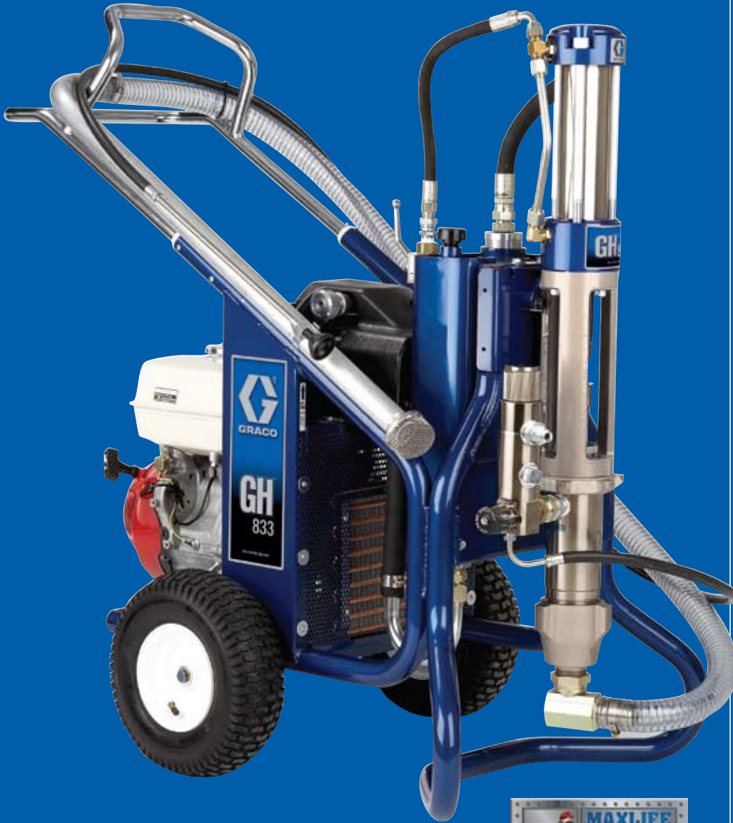
Bare Unit Shown

The gas hydraulic unit that can spray it all – the GH 833 “Big Rig”. The GH 833 is the answer for high production professional contractors who demand uninterrupted performance with the widest range of materials.