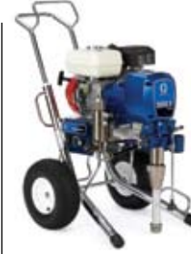
GMAX II 7900