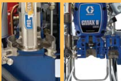
ProConnect system OPEN without pump in.

You can find the exclusive ProConnect System on these Graco sprayers!