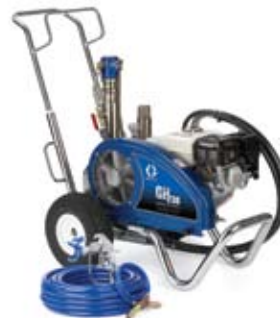
GH 230 Convertible