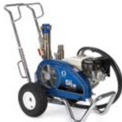
GH 230 Convertible

Max Tip: .053 Max psi/bar: 3300/227 Max gpm/lpm: 2.35/8.9 Engine: 200 cc Honda Weight lbs/kg: 168/75.6 Gun Support: