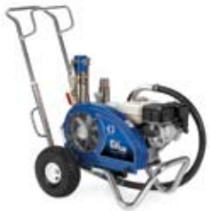
GH 130 Convertible

Max Tip: .037 Max psi/bar: 3300/227 Max gpm/lpm: 1.3/4.9 Engine: 120 cc Honda Weight lbs/kg: 150/68 Electric Max Tip: .031 Electric Max Gpm/Lpm: 1.1/4.2 Gun Support: