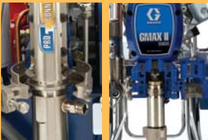
ProConnect system OPEN with pump in.