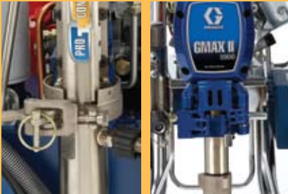
ProConnect system CLOSED with pump in.