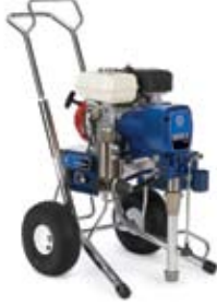
GMAX II 3900