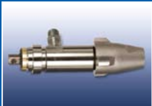
Exclusive Endurance Advantage Program eliminates downtime.

*Premium units include: AutoClean2, Digital Display and Toolbox.