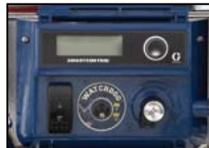
SmartControl provides high quality spray pattern plus the WatchDog Pump Protection System.