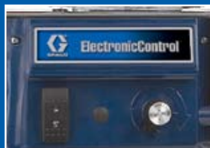
Electronic Pressure Control provides high quality spray pattern.