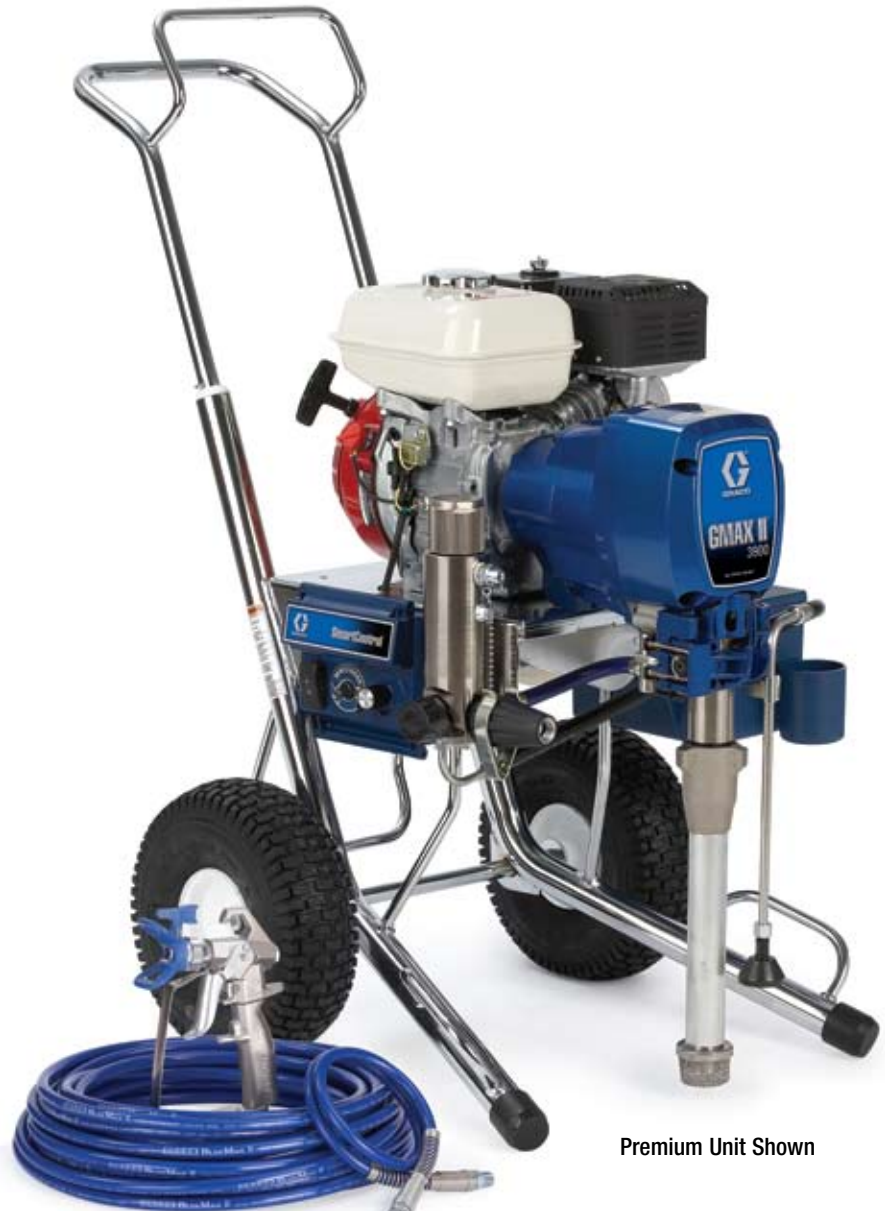
Premium Unit Shown