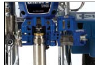
Exclusive ProConnect System – no-tools removal and installation for fast repairs on the job.