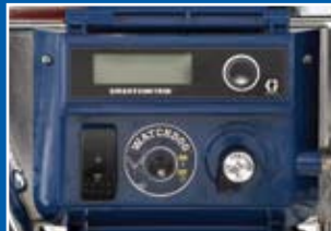
SmartControl provides high quality spray pattern plus the WatchDog Pump Protection System.