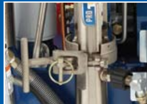
Exclusive ProConnect System, no-tools pump removal and installation.