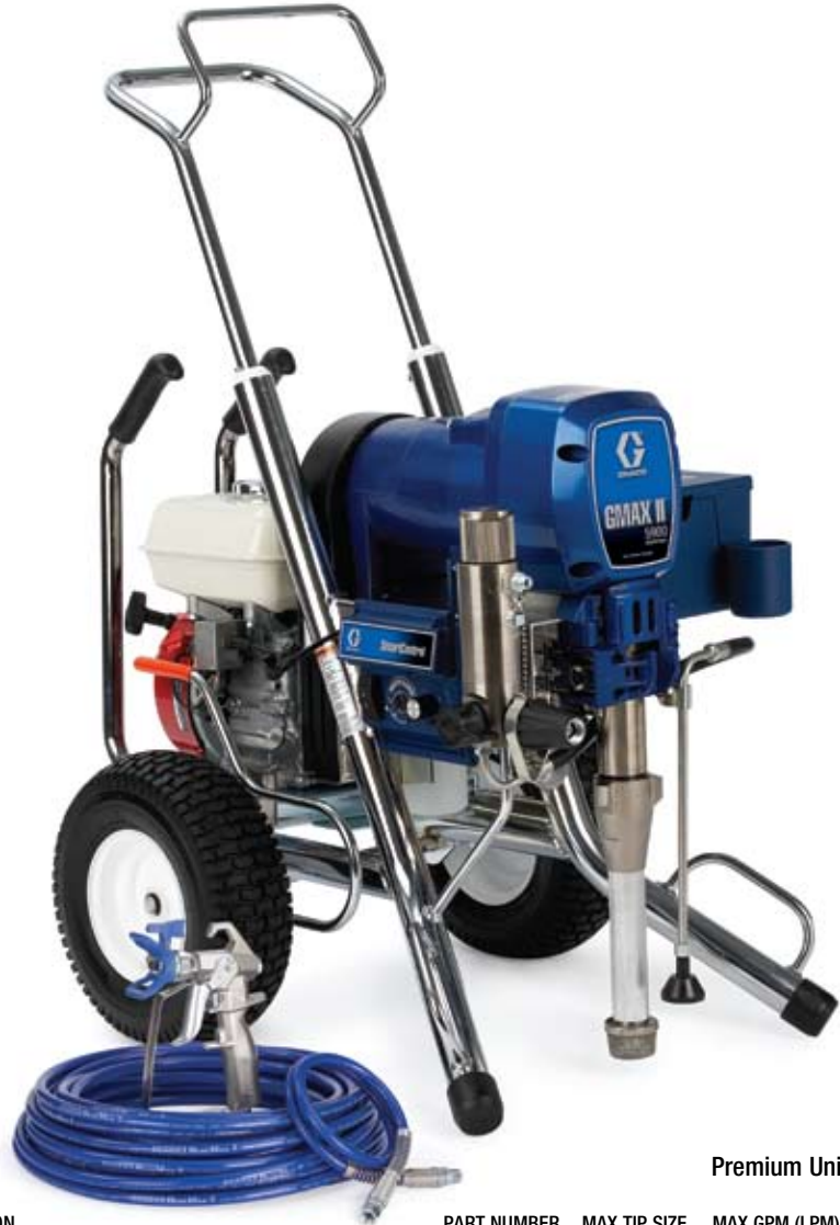
Premium Unit Shown