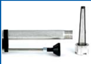
Exclusive crush-proof rock catcher provides unmatched pump protection. (patent pending)