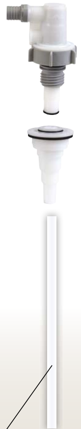
24F532 Quick connect inlet kit (above): Includes: 24F532 drum coupler, 124549 drum insert and 124550 down tube