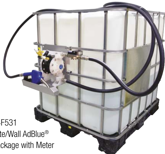
24F531 Tote/Wall AdBlue® Package with Meter