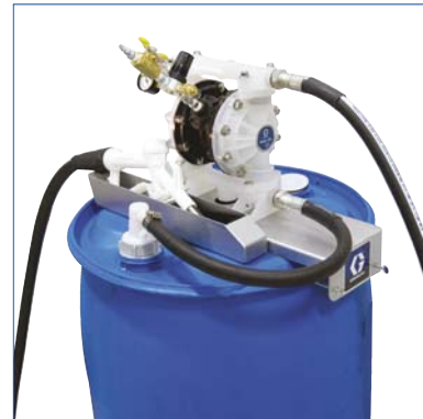
24F947 Drum AdBlue® Package without Meter