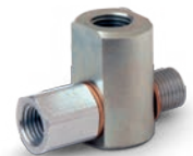
571058 / 571070