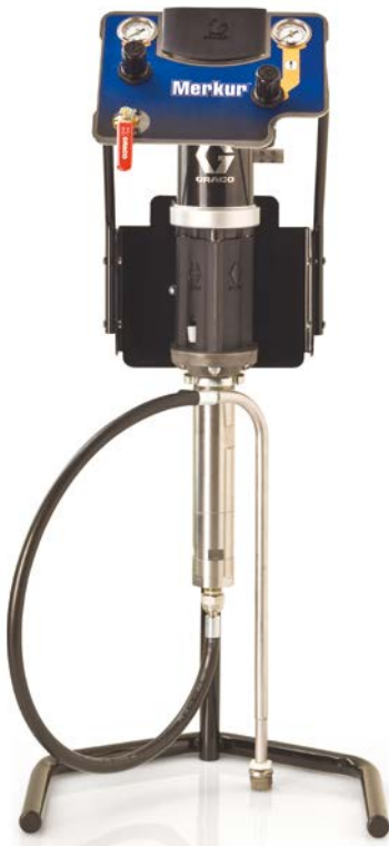
Air-Assist Stand Package