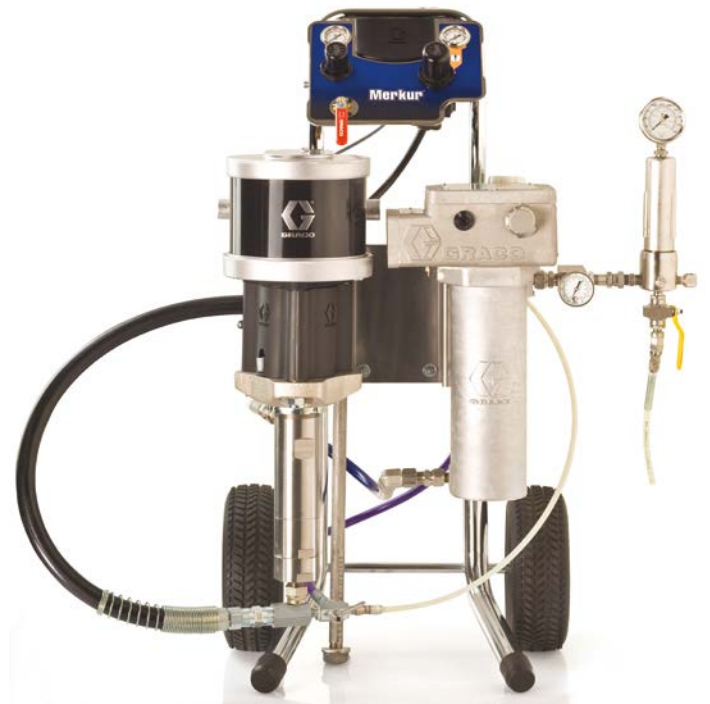
Heated Air-Assist Cart Package

*All packages have a 7.5 m (25 ft) fluid and air hose