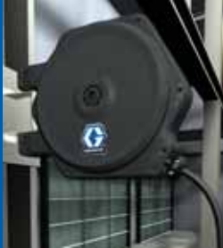
Ceiling/Wall Swivel Mount (standard)

Quality hose reels mount in minutes—gives you years of worry-free performance!