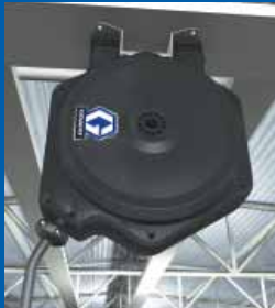
Ceiling/Wall Stationary Mount (optional)