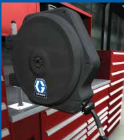
Bench Mount (optional)