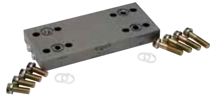
DP2-DP12-CS / DP2-DP2-SS* 3/8" bore, 9" length