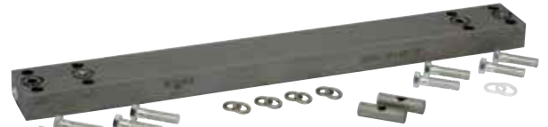
DP1-DP1-CS / DP1-DP1-SS* 3/8" bore, 23" length

NOSHOK differential pressure to differential pressure adaptors allow two differential pressure transmitters to be mounted on a single set of orifice taps. This configuration is ideal for applications such as bi-directional flow, and custody transfer where only a single set of orifice taps is available. Multiple adaptors are available for various application configurations and space restrictions.