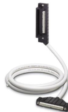
Illustration shows the product FLK 50-PA/EZ-DR/KS/ 200/YUC

http://eshop.phoenixcontact.de/phoenix/treeViewClick.do?UID=2321389