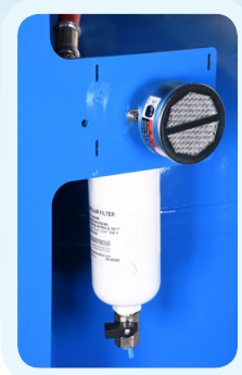
F200 Exhaust Filter with muffler