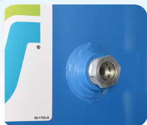
Desiccant Sight Window